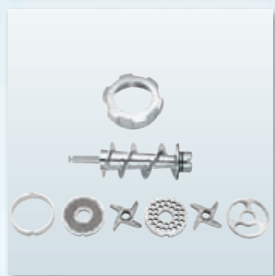
Cutting set for mincer made of stainless steel