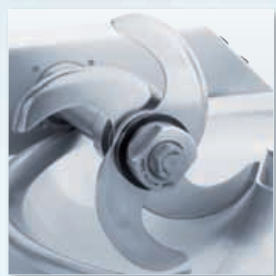
Cutter knives stainless steel