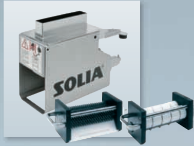
Steaker and meat tenderizer for AW CZ For steaking of raw meat and steaks.