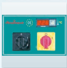
Control unit for CU 15